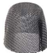
15584 Mesh Filter