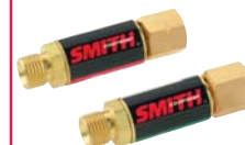
Flashback Arrestors see page 67