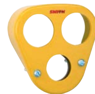
H195 "Hard Hat"™ Gauge/Regulator Guards see page 70