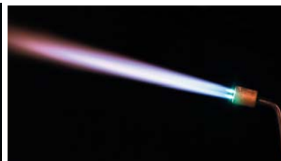
HEATING TIP (Rosebud)

NOTE: 1 PSI minimum for Natural Gas use.